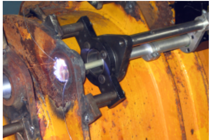
One Quick Setup - will attach to your Boring Bar Kit.